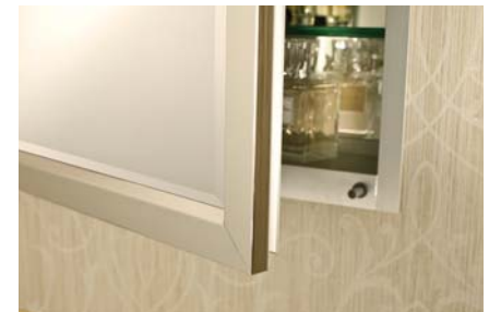
Side Mirror Kit SMK4-30 Order for Surface Mount