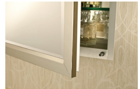
Side Mirror Kit SMK4-30 Order for Surface Mount